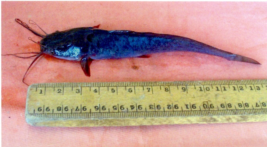
CLARIAS GARIEPINUS – EXPERIMENTAL FISH