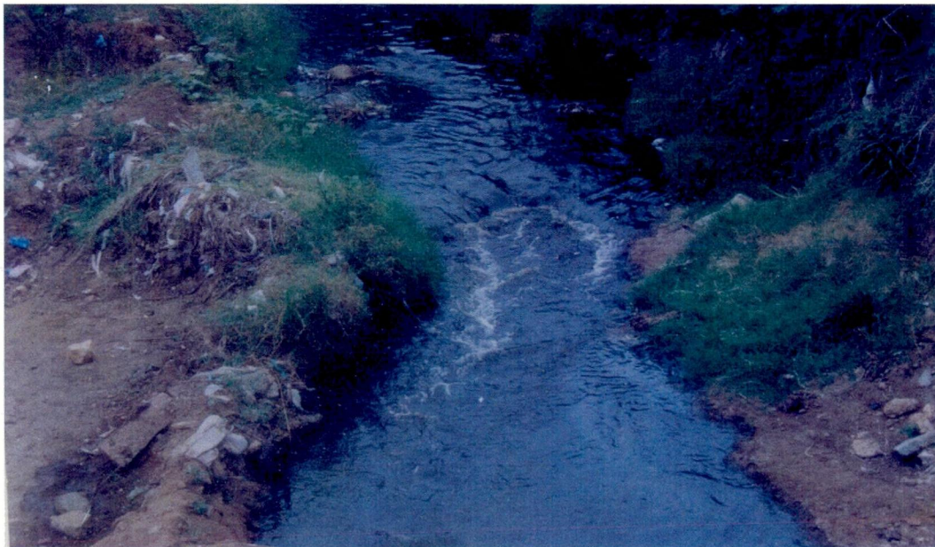
B. POINT OF DISCHARGE OF NICKEL ELECTROPLATING EFFLUENT