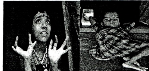
Endosulfan affected girls (5), (7)

Data(CETD) matrix. The row sum is obtained for CETD matrix and conclusions are derived based on the row sums. All these are represented by graphs and graphs play a vital role in exhibiting the data.