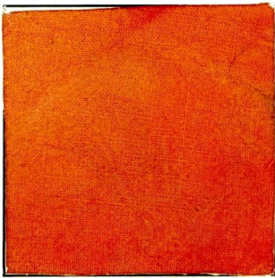
Ultrasonic atomized sample (C)