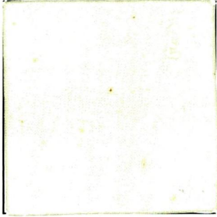
Pretreated sample (A)