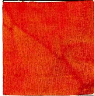
Conventionally finished sample (B)