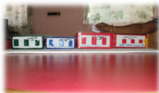
Plate 3. Coaches of 'S', 'V' 'IO' and 'DO'

wrongly filled by the player, the 'SP Express' does not move from the platform. And the train which fails to move from the station is treated as 'Cancelled for the day' with no points. So the players would try hard to fill the passengers into their correct compartments by seeing the coach names such as: 'S - coach', 'V - Coach', 'IO - coach', 'DO - coach', 'C - coach and 'A - coach' (Plates 3,4 and 5).