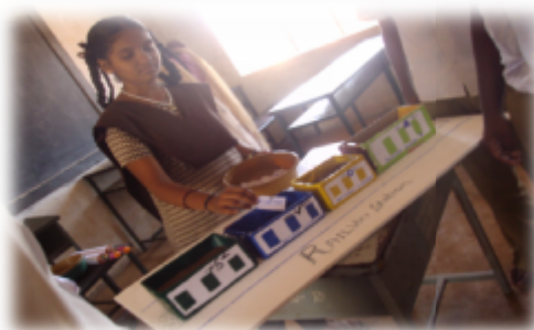
Plate 4. Pupils filling the coach 'V'