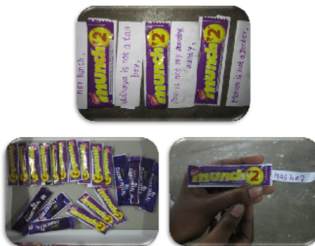
Plates 13-15. Matching Question Tags for the Game Munch the C

In order to draw the attention of the pupils, empty Chocolate wrappers (packets) were kept on the table arranged one top of another. Statements (Questions) were written on a strip of white paper and stuck on the packets. The player has to pick the chocolate wrapper, read the question on the white paper and he is to write the related Tag (answer) on the finely cut chart paper which is kept inside the wrapper. If the player writes the correct answer, it means that the player has tasted or enjoyed the chocolate. If the player fails to write correctly it means that he gets no chocolate to enjoy and no points for the team. Both the question and the answer are read out to the class by the player himself. If the player writes the correct answer, the team gets a point or otherwise the team gets no points (Plates 13 - 15).