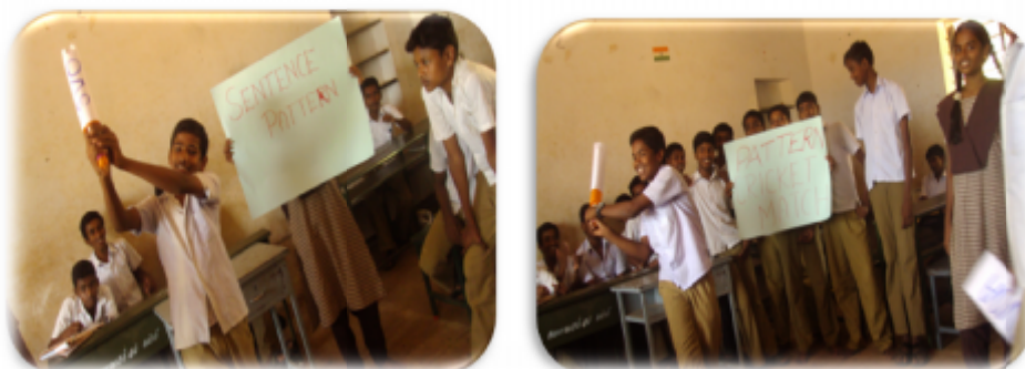
Plate 7 & 8. Pupils Batting in Cricket Match with Matching SP