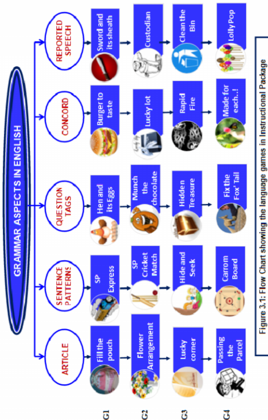
Figure 3.1: Flow Chart showing the language games in Instructional Package