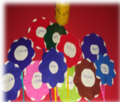
Plate 2. Flowers with articles 'a' 'an' and 'the'