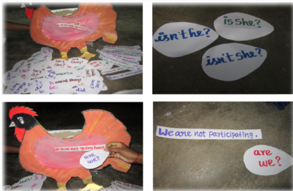
Plate 9-12. Steps in the game Hen with Eggs (Question Tags)

The investigator, at random with equal number of boys and girls divided the pupils into two groups namely, 'Wren' and 'Martin' by numbering them as 1 and 2. The investigator gave instructions about how the game has to be played. The investigator would take the strip to insert it in between two slits on the hen's side portion. Statements were written on the strips in a different colour on the dorso ventral side of the hen and a number of oval shaped finely cut chart paper eggs of different colours are kept on the back side of the hen. The player is to read the statement written on the strip that is badged on the hen and he/she must write the answers (Tag) on the Chart paper egg. If the player writes the correct answer on the egg, the team gets a point or otherwise the team gets no points (Plates 9 to 12).