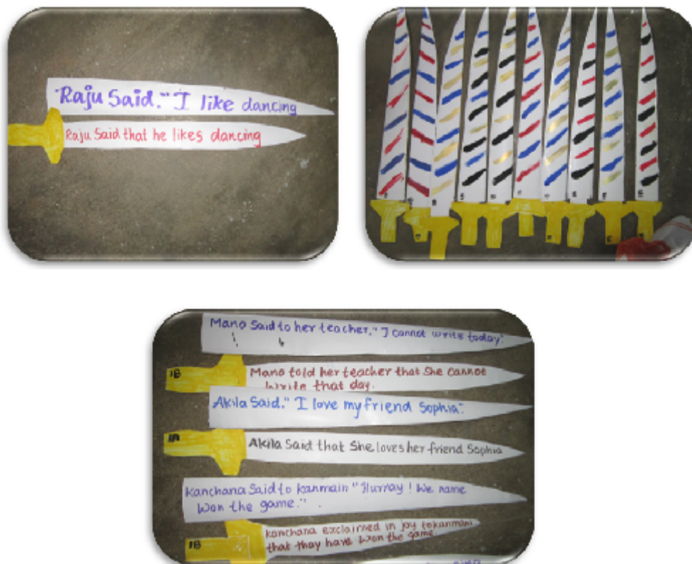
Plate 23-25. Sword and its Sheath for Reported Speech

Sword: Rahul said that he likes dancing (Indirect speech)