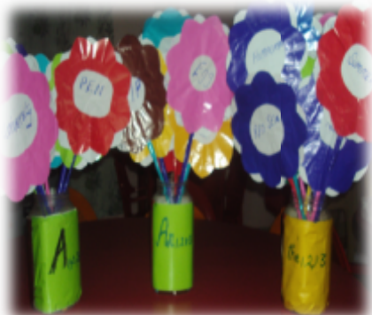
Plate 1. Flowers Arranged by Pupils