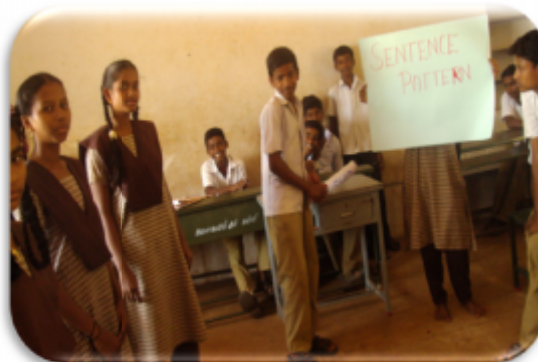
Plate 6. Pupils Ready to Bat in 'Cricket Match'

The bowling team are made to stand red alert for fielding and they can also help the batsman to pick the right bat if he faces difficulty. The whole class, which is otherwise the Arena, is found to be in a roaring applaud, motivating and encouraging their team members to win the match. The investigator is the deciding umpire to maintain the score board (Plate 6, 7 and 8).