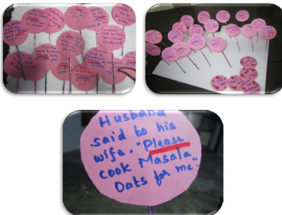
Plates 26 to 28. Lolly Pops for Reported Speech

After reading those questions on the pink colour lolly pop given to them, each pupil is expected to write the answer on a white colour lolly pop which is again given to them. The correct sentences should be written on the white colour lolly pop given to them after reading aloud the questions on their lolly pops. If the pupil wrote the correct answer, the team to which he belonged was given a point on the score board and in case, he / she gave a wrong answer then the team lost points. Likewise, they enjoyed their lolly pops (Plates 26 - 28).