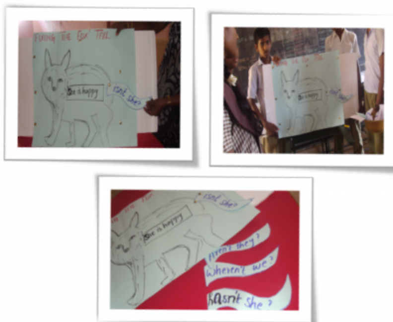
Plate 16-18. Fixing the Fox' Tail for Question Tags

The investigator, at random divided the pupils into two groups namely, 'Wren' and 'Martin'. The investigator gave instructions about how the game "Fixing the Fox' Tail" has to be played. Each team encompasses about 30 players. A big picture of a fox without a tail is drawn on a chart paper (pink colour) and fixed on a flannel board. The tail-less fox was labelled with the statement on its torso-ventral side. The pupil who represents the team comes forward, reads the labelled statement and searches for the suitable correct tag (tail) from the tag- basket in which tags with different colours were finely cut into the shape of a fox' tail. Thus, the student scores a point if he fix' the right tail (tag) for 'the tail-less fox' within the time allotted (30 seconds) failing, the player was out of game with a zero scoring (Plates 16-18).