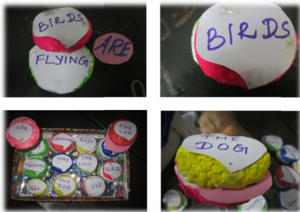
Plate 19-22. Burger to Taste for Concord

The investigator, at random divided the pupils into two groups namely, 'Wren' and 'Martin'. The investigator gave instructions about how the game, 'Burger to Taste' should be played. Burger is made of tasty and colourful layers. The three layered Burger is; 'the subject' and the bottom layer, 'the object'. The middle layer is unfilled and the player has to pick the appropriate 'verb' and fit it in the middle in place of the 'verb' to enhance the taste i.e. If the top layer is a singular subject word then the verb in the middle should also be in its singular form only and if the subject is plural, then the verb on the burger should also be plural. This is otherwise grammatically called 'subject - verb agreement'. The verbs were of both singular and plural - and assortment of both singular and plural (Plates 19-22).