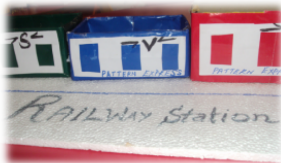
Plate 5. Coaches in 'Sentence Pattern'