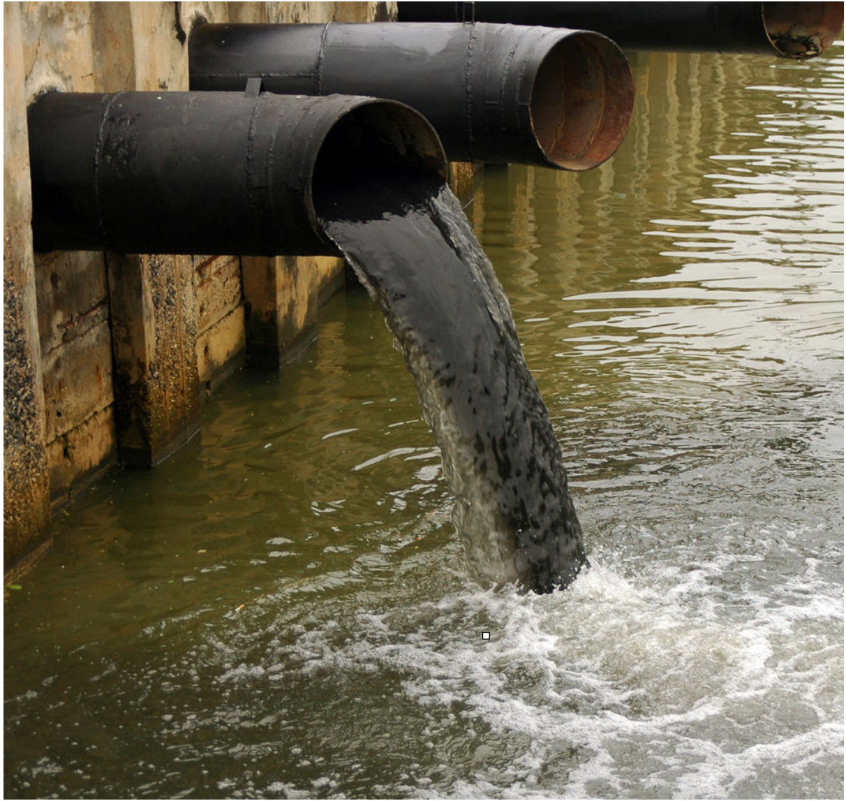
FIG. 2 DISCHARGE OF EFFLUENT FROM THE INDUSTRY