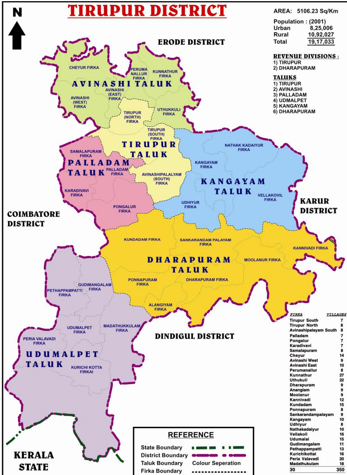
FIG . 1- MAP OF TIRUPPUR DISTRICT