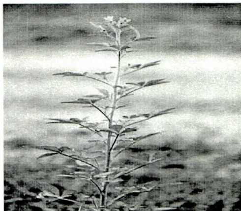
Plate I: Cleome viscosa