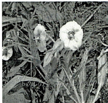
Plate I: Trichodesma indicum