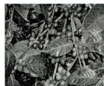
Ripened Coffee Beans

Based on their land holding (in acres) the respondents were grouped into six categories as detailed below: