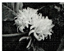
Bunch of Coffee Flowers