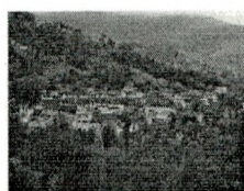
A Village in the Study Area